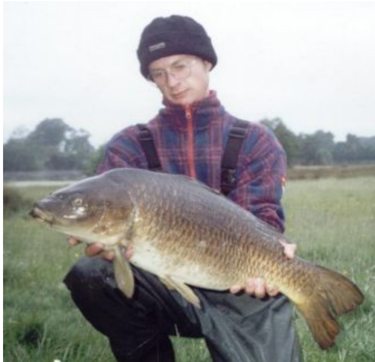
'Mental the Common' on one of his regular appearances

The other fish of note was a double figure common that I must have caught five times throughout the season, a cracking fish that gave me the fight of my life each time I had it - far better than any of the twenties! - Its takes were so violent that it ripped the rod of the buzzer-bar on two separate occasions! We nicknamed it 'Mental the Common' for obvious reasons, and it was a joy to bank on each occasion. The funny thing with Mental was that he would only show on a rod that had already banked a fish during that particular session – weird!