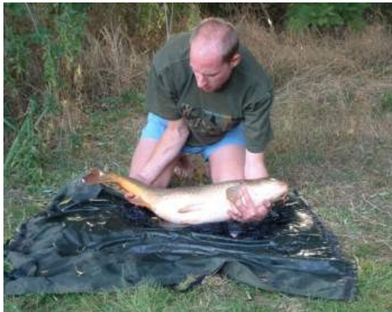
Ready to lift...

With the photographer in front of you, you want to have the fish on its side with back towards you and belly towards camera. Then, carefully scoop your hands under the fish from behind and bring them round to the front of the body. Scoop one hand under the head and slide the pectoral fin between your fingers. Then scoop the other hand under the rear section around to the anal fin area (see photo below). Then, slowly lift and level the fish. Be prepared for the fish to kick and be ready to cushion it when it does! I've found this method of lifting to be by far the most effective giving good stability to counter the fish when it decides to kick. Keep the fish low to the mat and hold it steady. Big fish can be hard to hold still so it helps to brace the fish; I tend to keep my elbows on my knees which gives a more rigid frame. A quick photography tip here; it helps for the photographer to be at the same level as you, i.e. close to the ground - either kneeling down or, even better, lying down. This gives a great perspective rather than if you are on the floor and the photographer is standing up directly in front of you, the sharp angle when taken from above will make your capture look much smaller than it actually is!